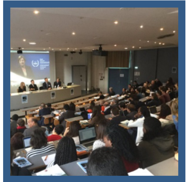
Colloquium on International Criminal Justice on the occasion of the 30th anniversary of the Klaus Barbie trial, on 23 and 24 November 2017, University Grenoble Alpes.