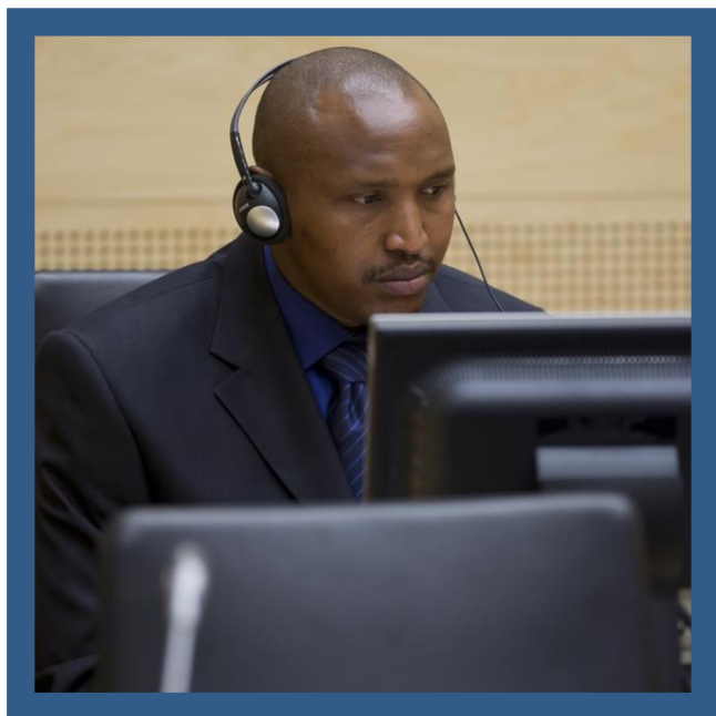
Bosco Ntaganda

There were 2149 victims divided into two groups who were allowed to participate in the proceedings. There were 1859 in the first group and are the so-called victims of the attacks, three of whom appeared as witnesses and five for the purpose of presenting their views and concerns. This occurred between the end of the Prosecution case and the beginning of the Defence case. The remaining 297 victims belong to the group of former child soldiers, none of whom were called to testify or to present views and / or concerns.