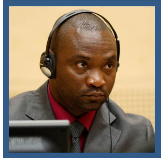
Germain Katanga

On 7 March 2014, Mr Germain Katanga was found guilty as an accessory to crime against humanity and war crimes committed on 24 February 2003 during the attack on Bogoro, Ituri in the Democratic Republic of Congo. On 23 May 2014, he was sentenced to 12 years of imprisonment. On 24 March 2017, Trial Chamber II issued Reparations Order. Katanga, the OPCV, and the Legal Representative of Victims appealed Reparations Order. The Appeals Chamber confirmed in part the Reparations Order, reversed the Order regarding five applicants and instructed the Trial Chamber to perform a new assessment of these applications.